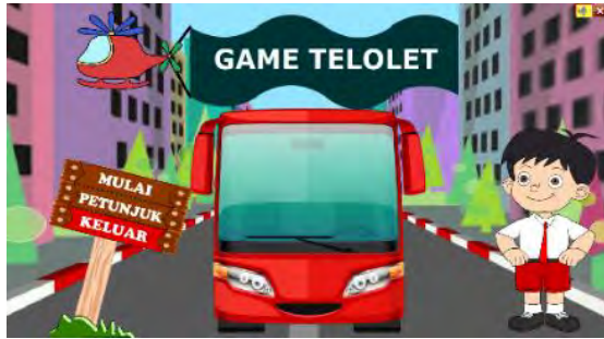
Fig. 2. Design of Telolet Game

The following is the front page design of the "telolet" educational game.