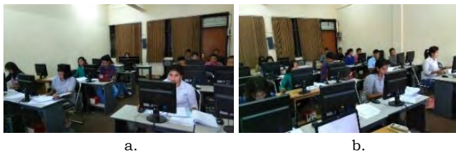
Fig. 3. Scaffolding process based on Telolet Game

At this stage, researchers conduct Scaffolding based on the "telolet" game and make observations during the Scaffolding process. The following is a picture of the Scaffolding process.